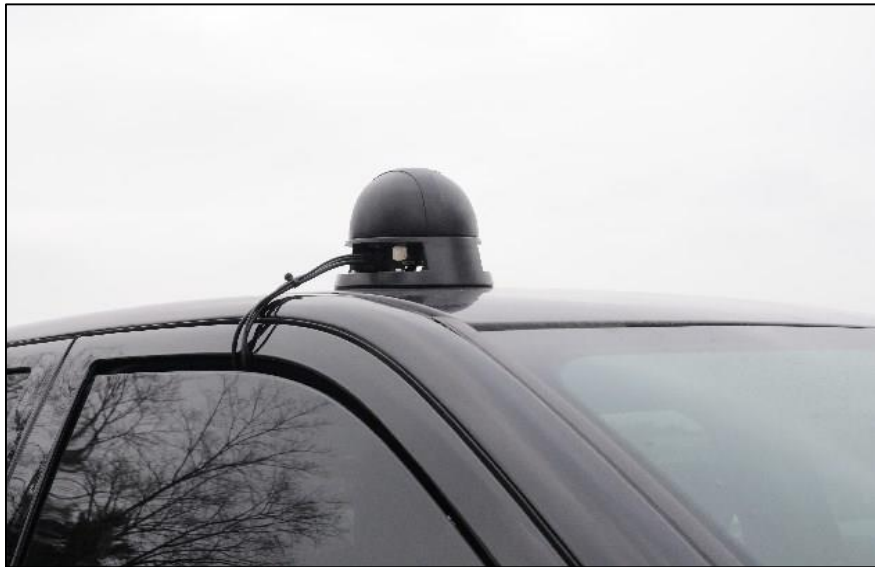
Omnidirectional Antenna with Available Roof Mount

Range – 500m terrain dependent (1640 ft)