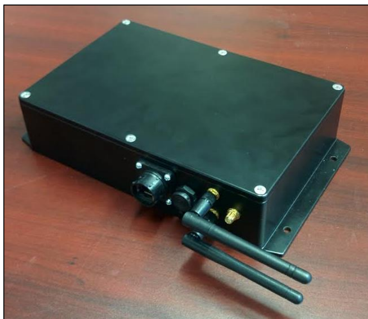
V2 Sentry with Covert Antenna

Designed with ease of use in mind, there is no on-site start-up time or the need for a continuous operator.